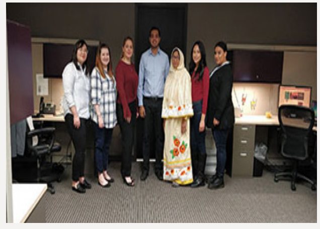
The ColonoscopyAssist team in our new office

The team is thrilled to be in the newer and larger office space which will allow to add more members to our team to expand the program. Growing our team in the new office will allow us to expand the program to more communities nationwide. We are excited to see what communities ColonoscopyAssist will expand into next!